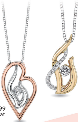
A. $399.99 1/10 Carat

Passions Flame pendant an ultimate love present for every occasion.