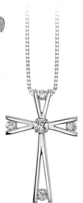
M. $79.99 1/10 Carat tw