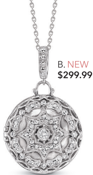
B. NEW $299.99