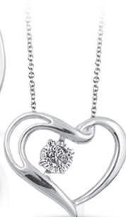
D. $99.99 .05 Carat tw Sterling silver

RHYTHM OF LOVE. Powered by her Heartbeat