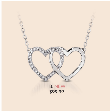
B. NEW $99.99