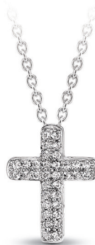
L. NEW $199.99