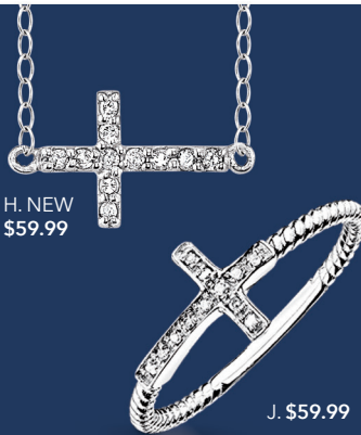
H. NEW $59.99