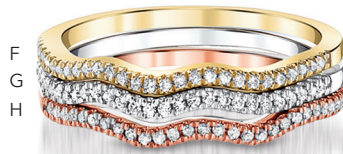
F G H STACKING RINGS YOUR CHOICE $199.99