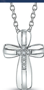
K. $49.99 .02 Carat tw