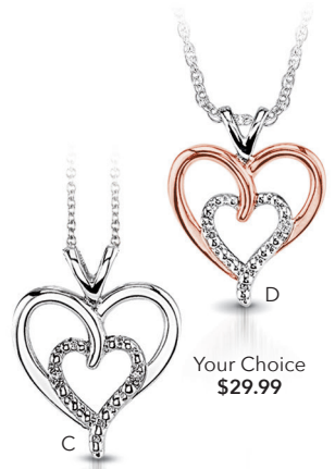
Your Choice $29.99