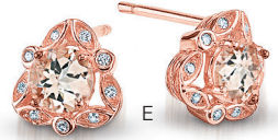
E BLUSHING MORGANITE 10K rose gold, morganite and diamonds