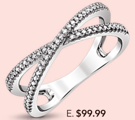
E. $99.99 1/10 Carat tw