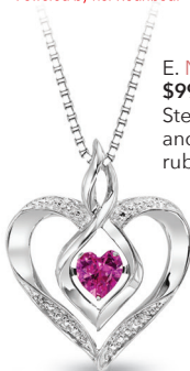
E. NEW $99 Sterling silver and created ruby

RHYTHM OF LOVE. Powered by her Heartbeat