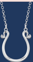
G. $59.99 Sterling silver with diamond