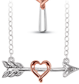
NEW C. $149.99