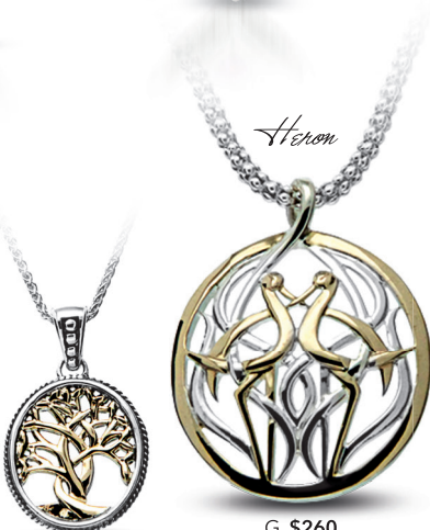
F. $249.99 Sterling silver 10K yellow gold