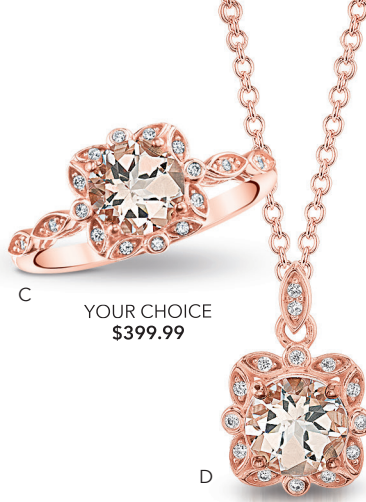
C YOUR CHOICE $399.99