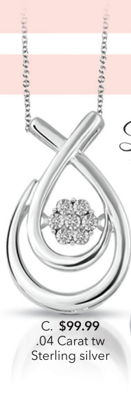
C. $99.99 .04 Carat tw Sterling silver